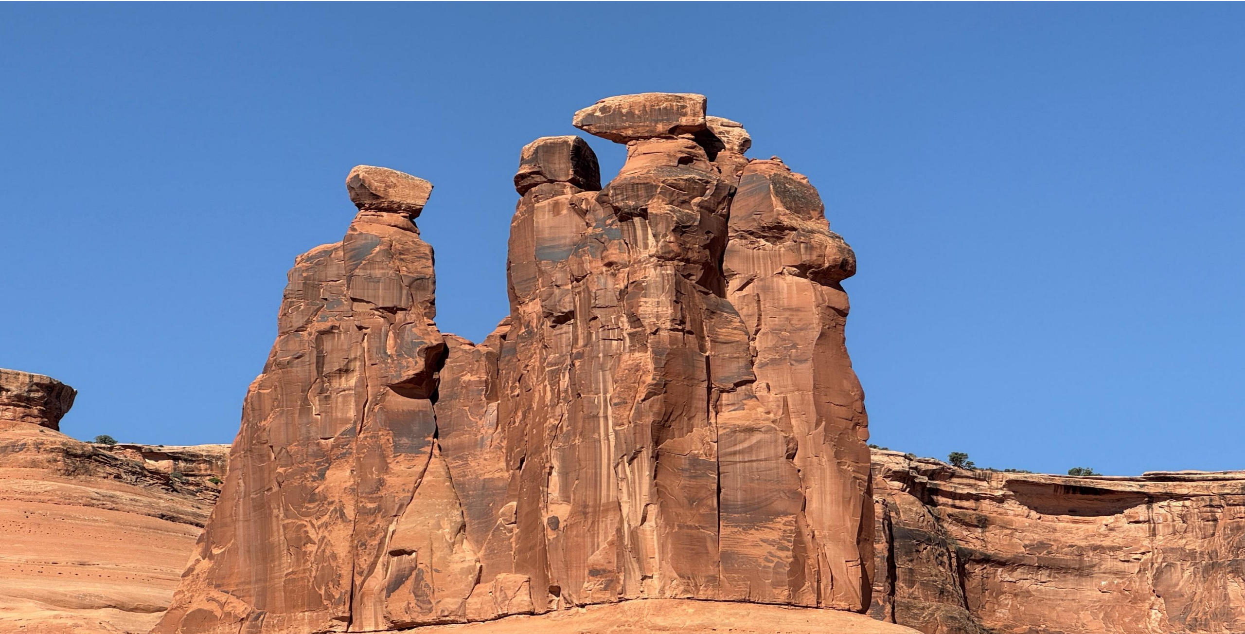
Kelly's June 2024 photos of Arches National Park