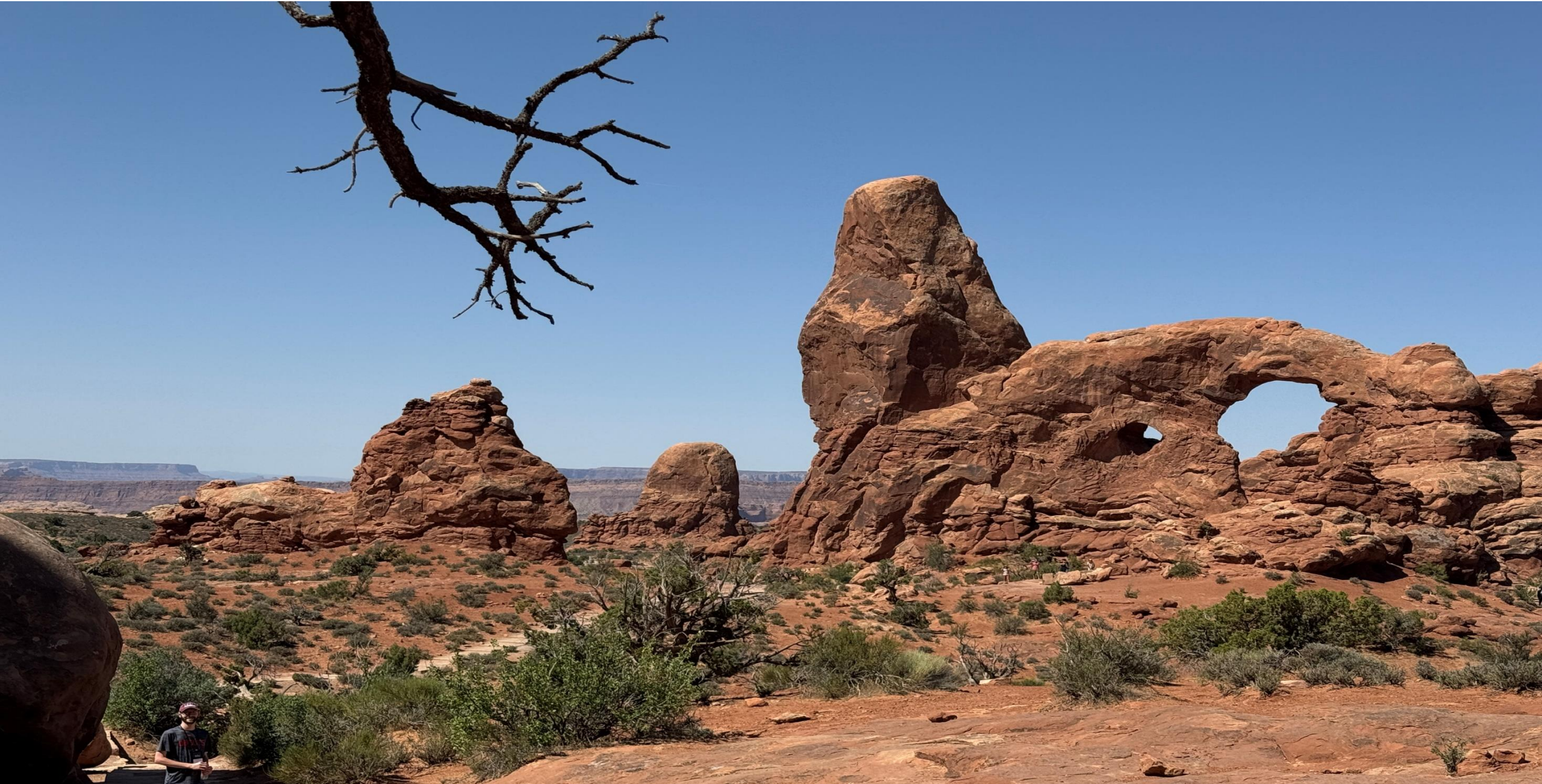
Kelly's June 2024 photos of Arches National Park