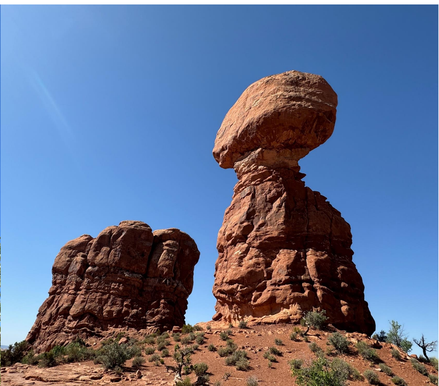
Kelly's June 2024 photos of Arches National Park