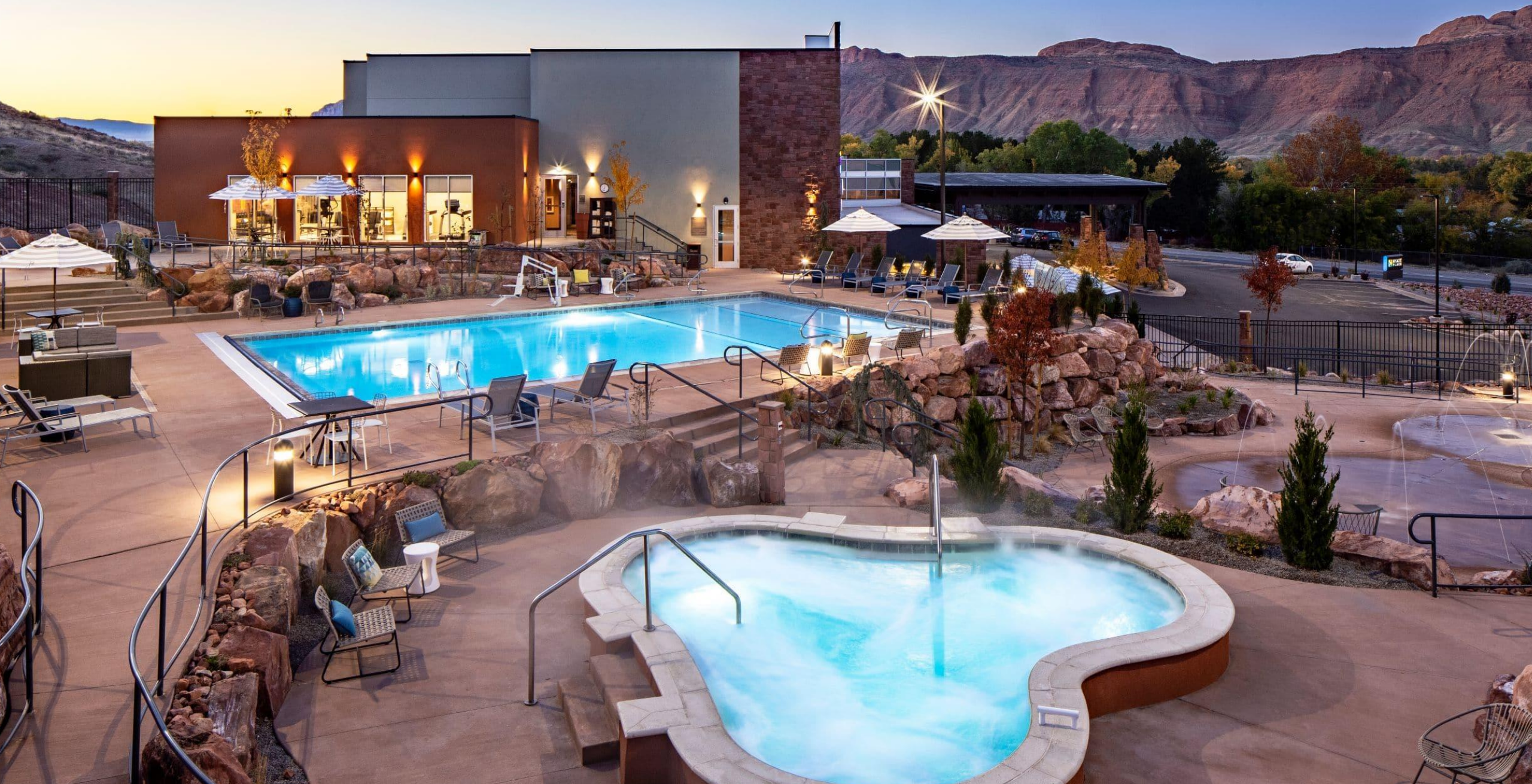
Hyatt Place, Moab – with easy access to nearby National Parks