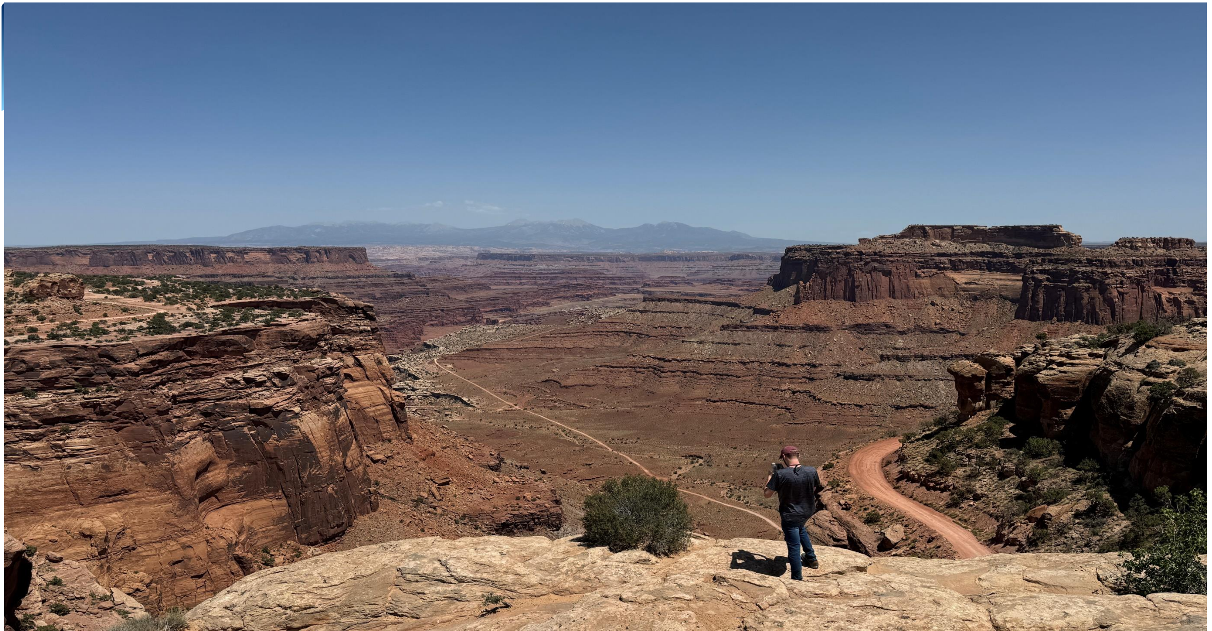
Ryan Shannahan photographing Canyonlands National Park June 2024