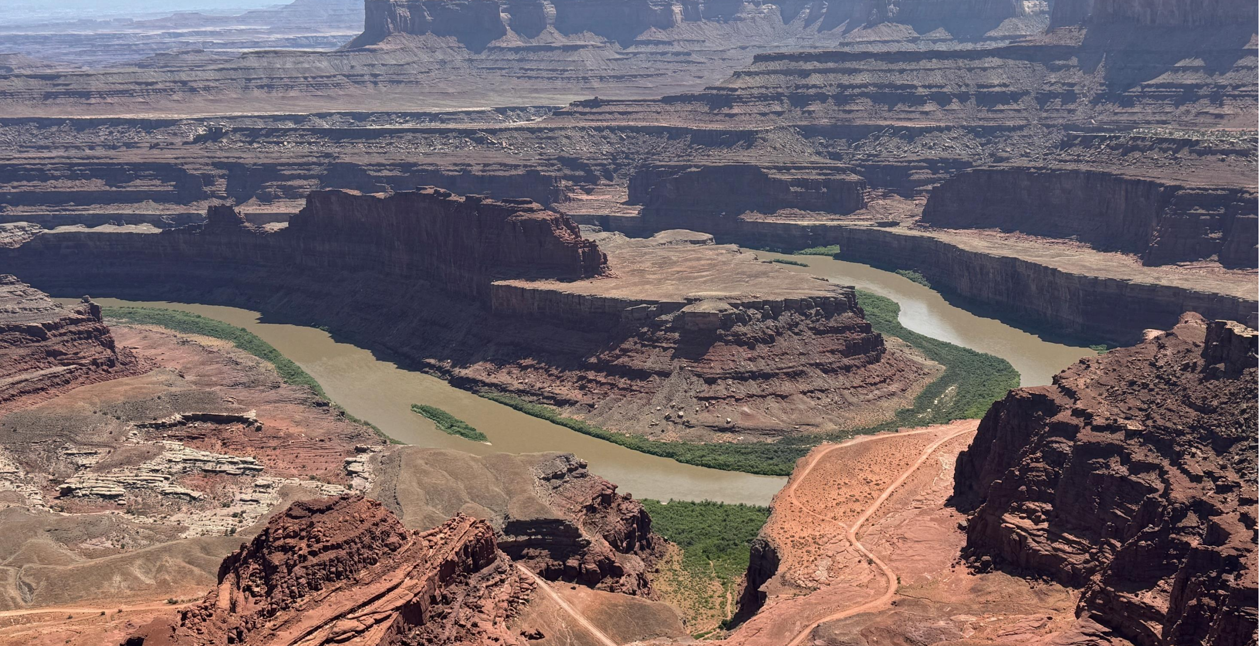
Kelly's June 2024 photos of Dead Horse Point State Park