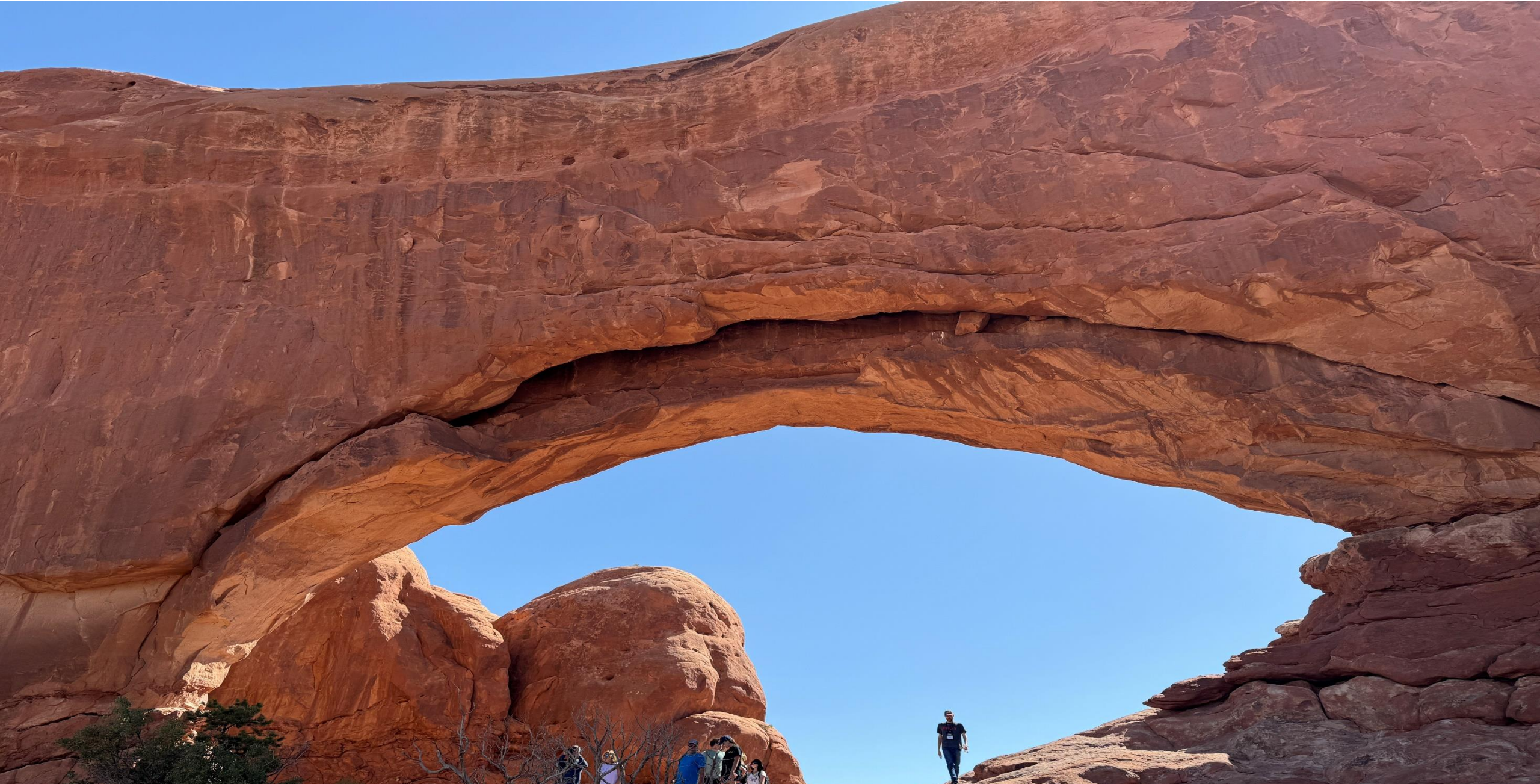
Kelly's June 2024 photos of Arches National Park