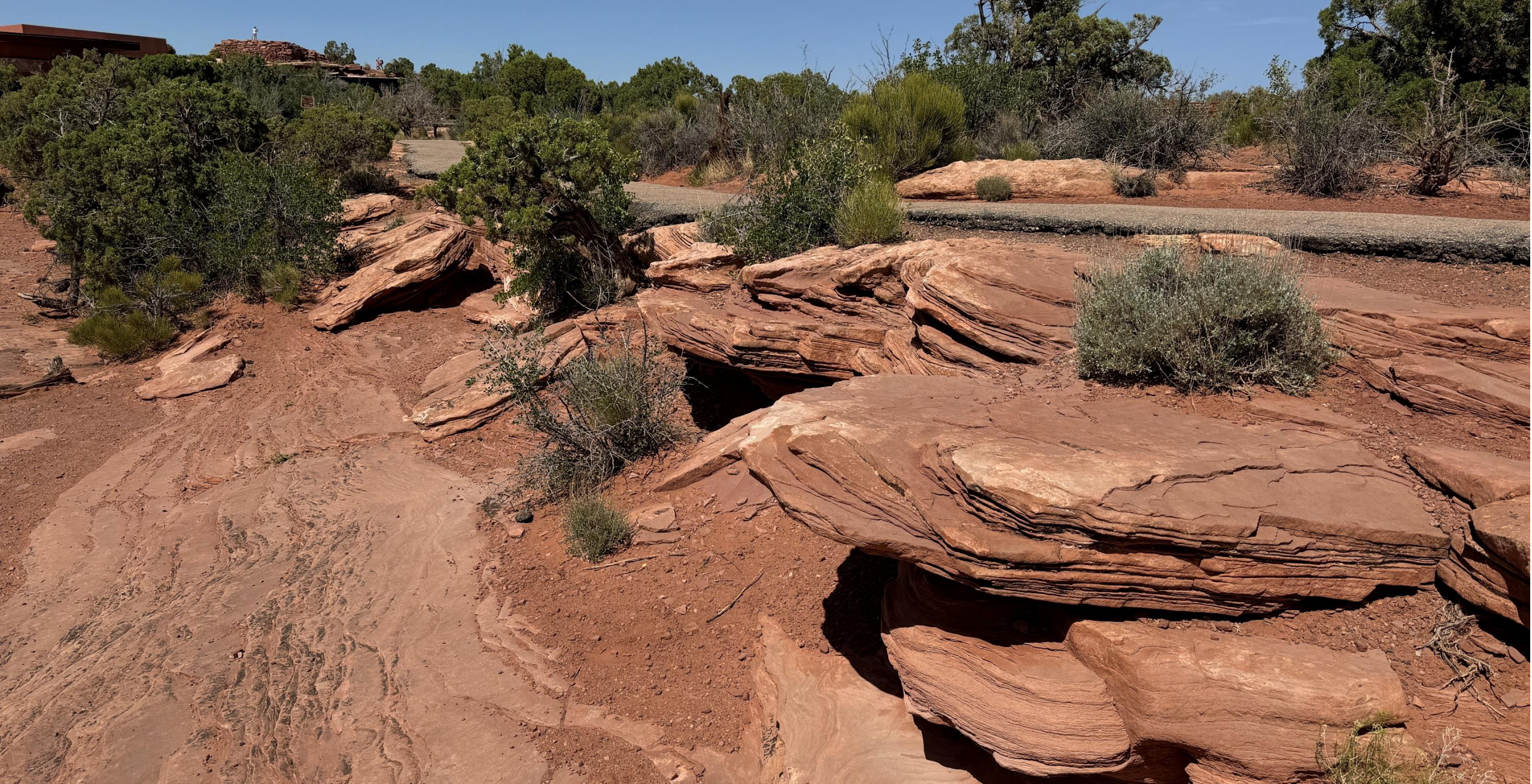
Kelly's June 2024 photos of Dead Horse Point State Park easy paved trail (top)