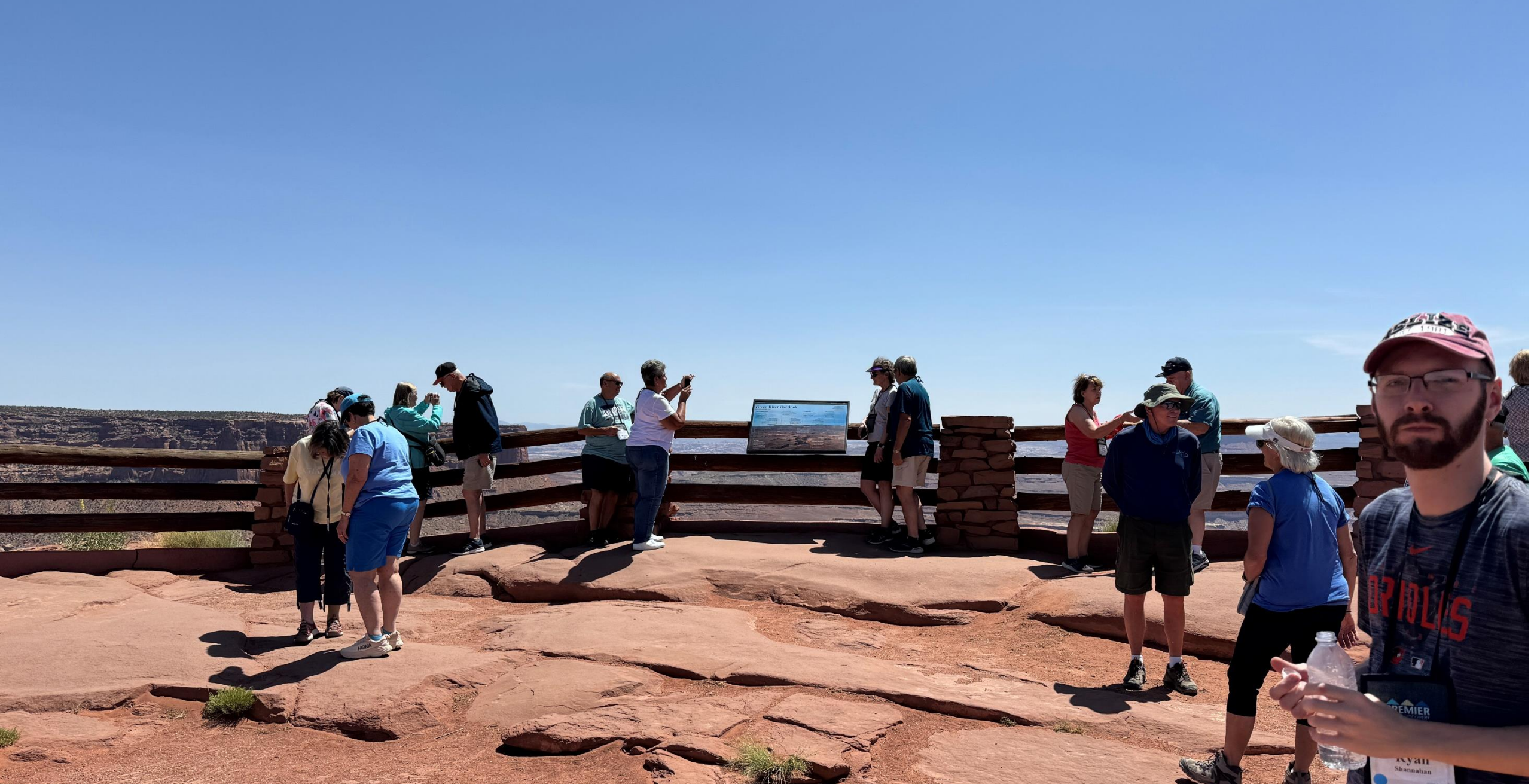
Kelly's June 2024 photos of Dead Horse Point State Park