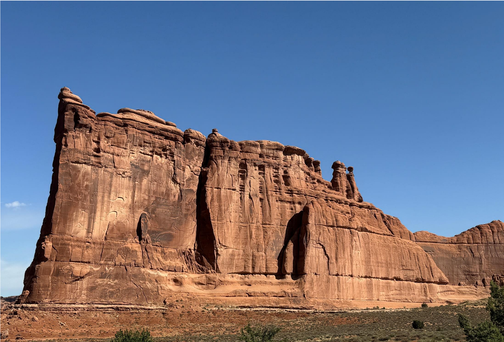
Kelly's June 2024 photos of Arches National Park