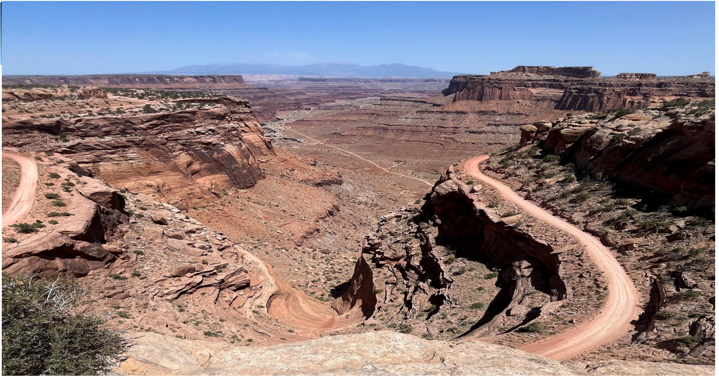
Kelly's June 2024 photos of Canyonlands National Park