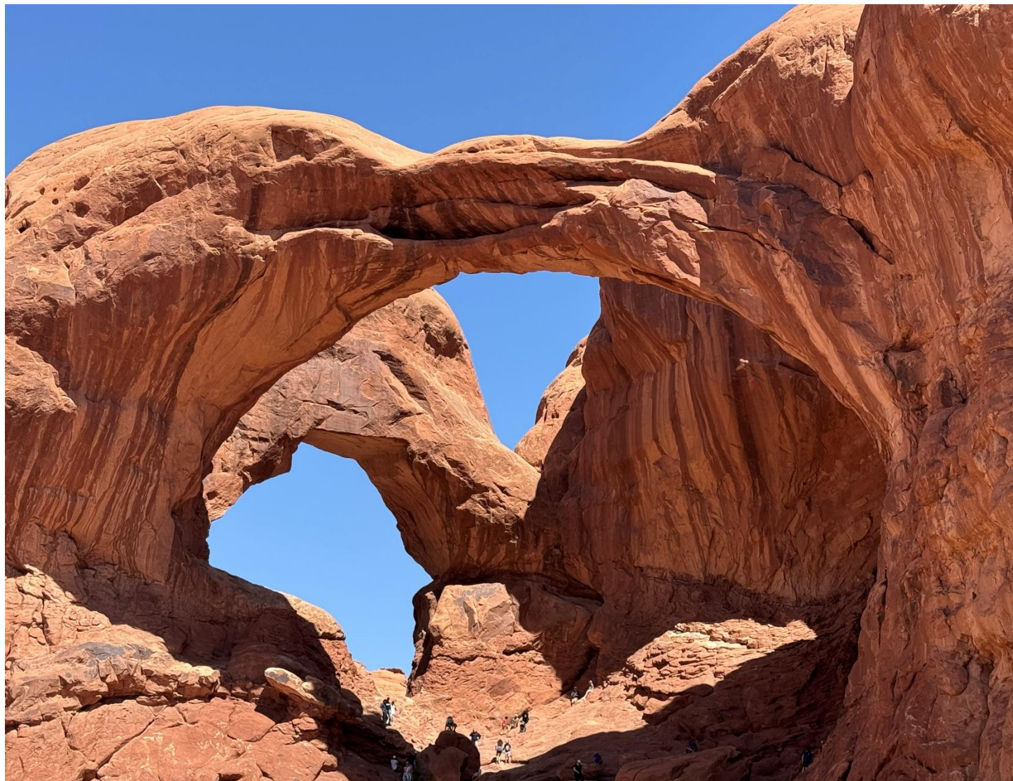
Kelly's June 2024 photos of Arches National Park