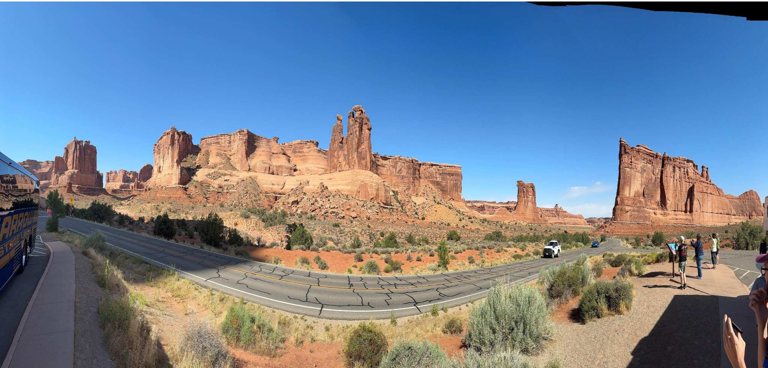
Kelly's June 2024 photos of Arches National Park