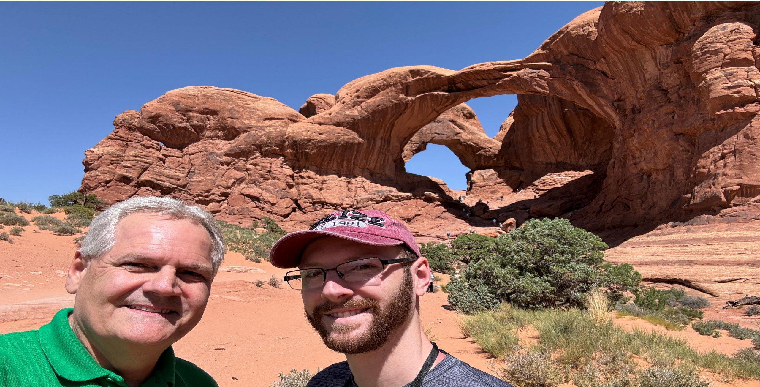
Kelly's June 2024 photos of Arches National Park