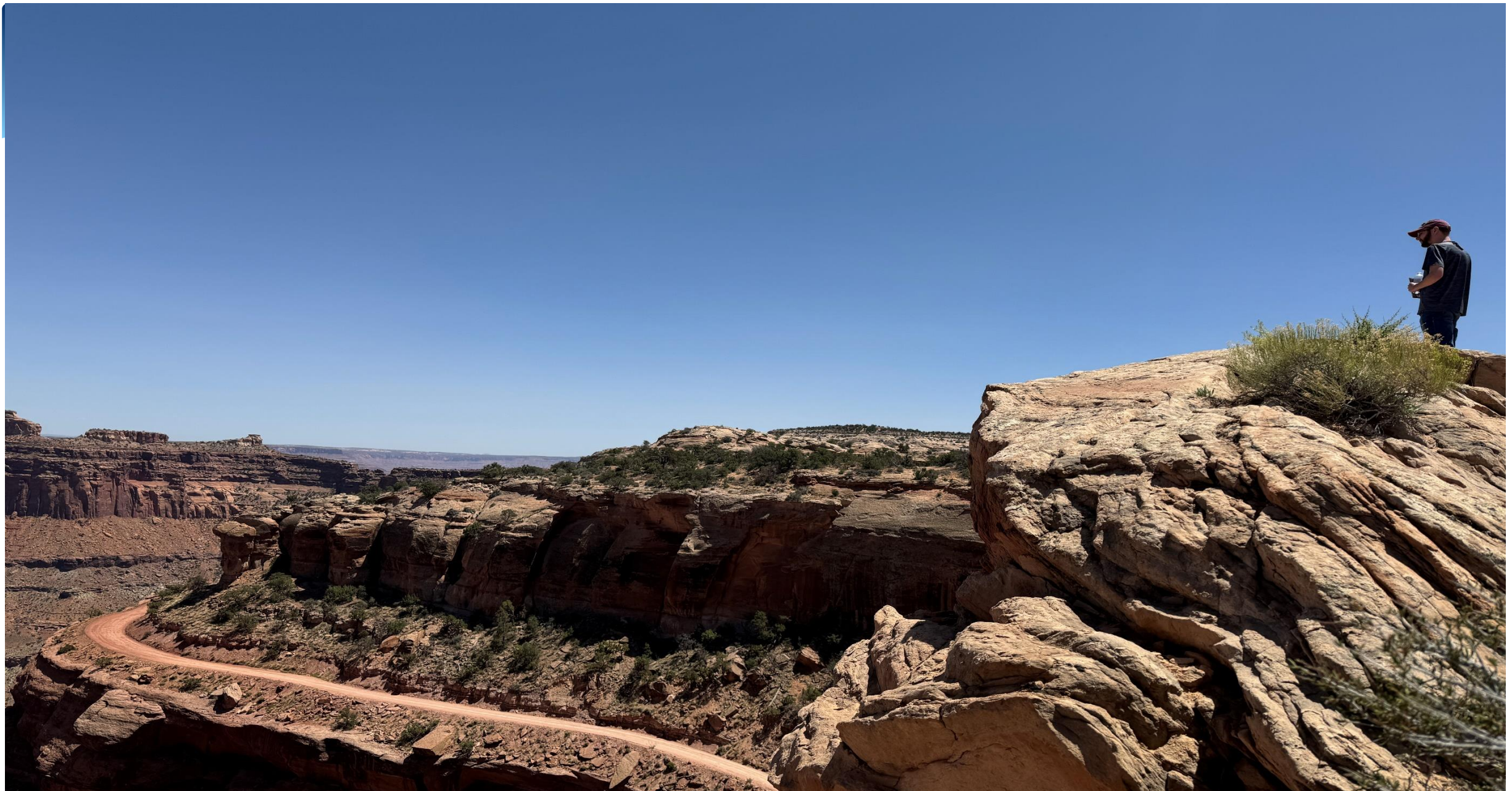
Kelly's June 2024 photos of Canyonlands National Park