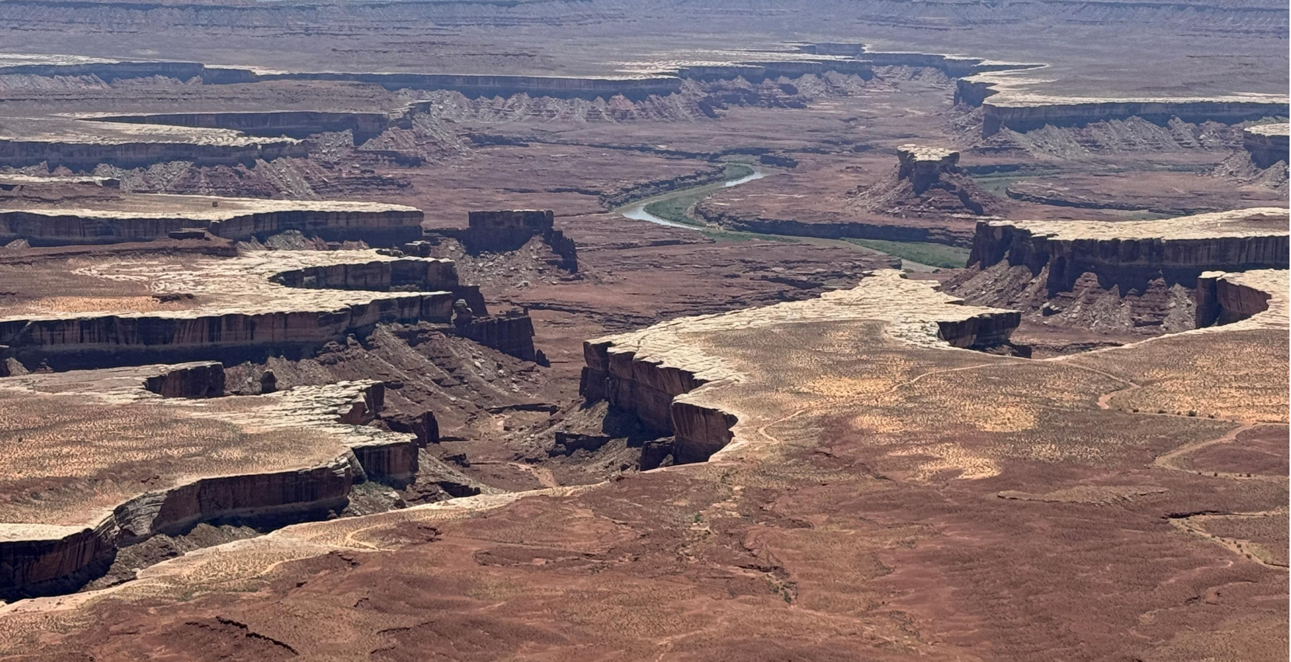
Kelly's June 2024 photos of Dead Horse Point State Park