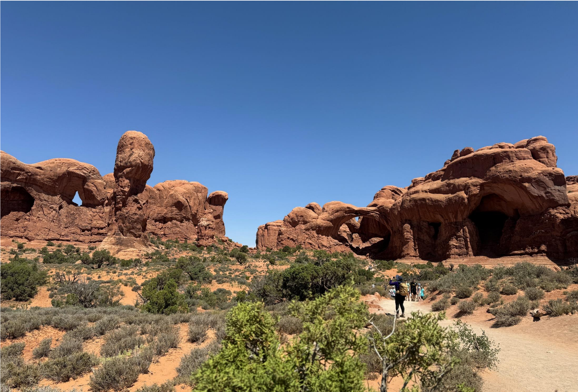
Kelly's June 2024 photos of Arches National Park