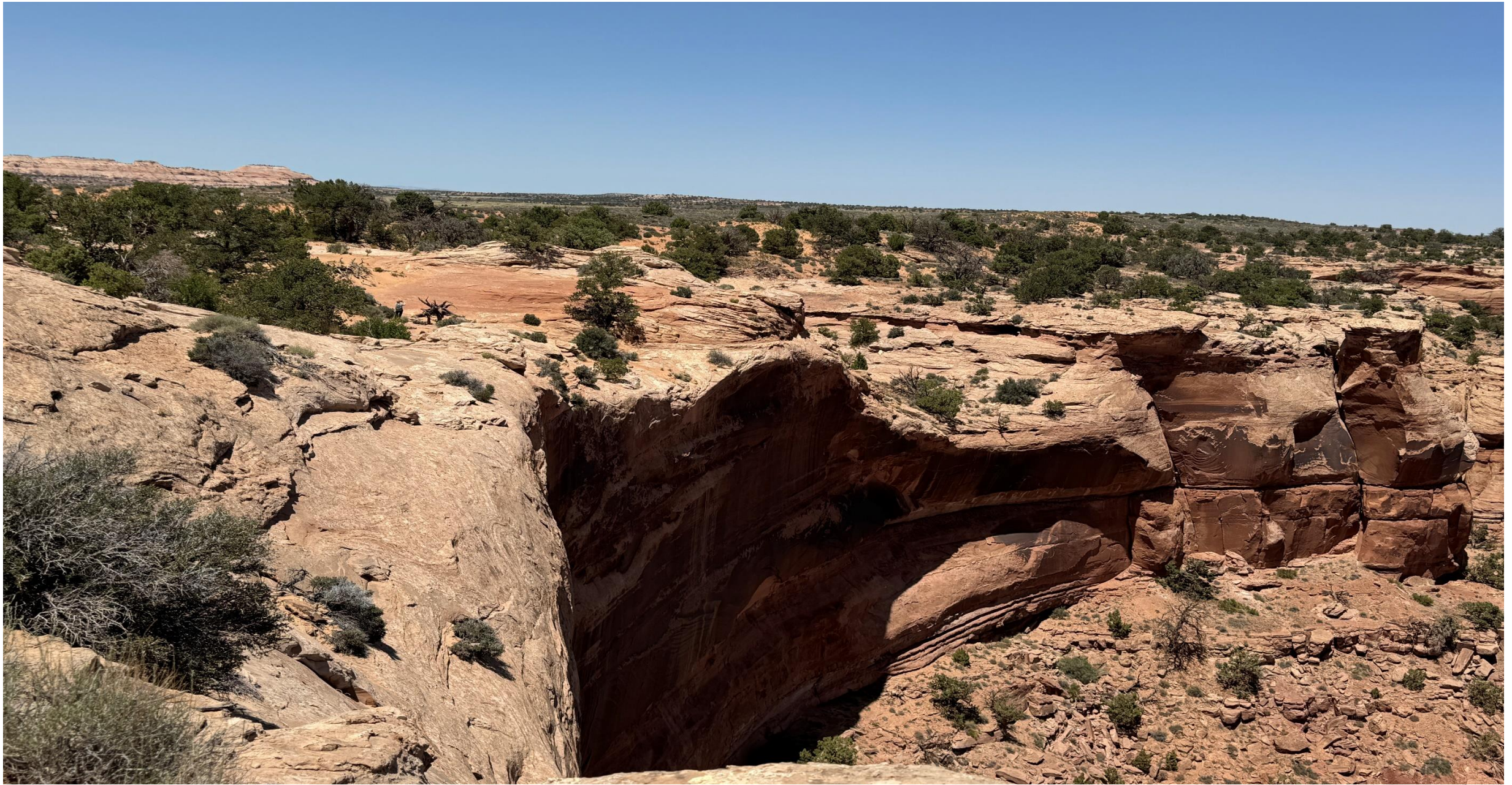
Kelly's June 2024 photos of Canyonlands National Park